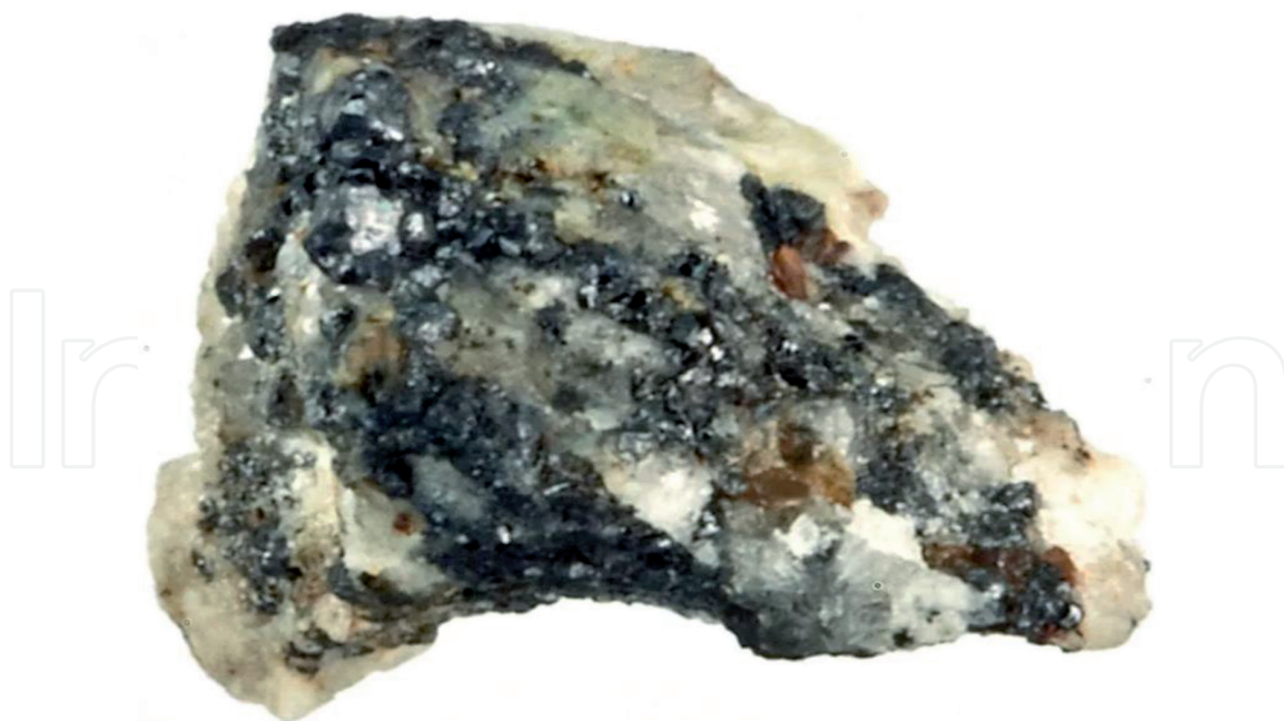
Figure 3. Light image of entire MSNF specimen prior to sampling, Khatyrka CV 3 meteorite [42].

Moreover, some papers argue that such a rock may be of manmade origin, as Bindi et al. noted: