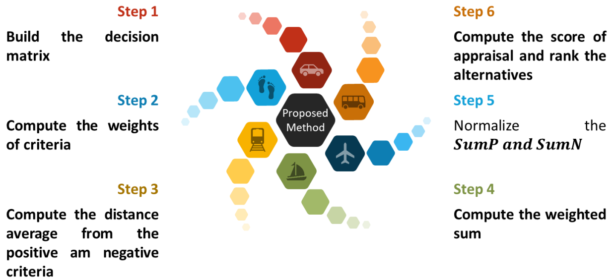
Figure 1: The steps of the proposed method.