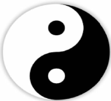
Fig. 1 Yin and Yang